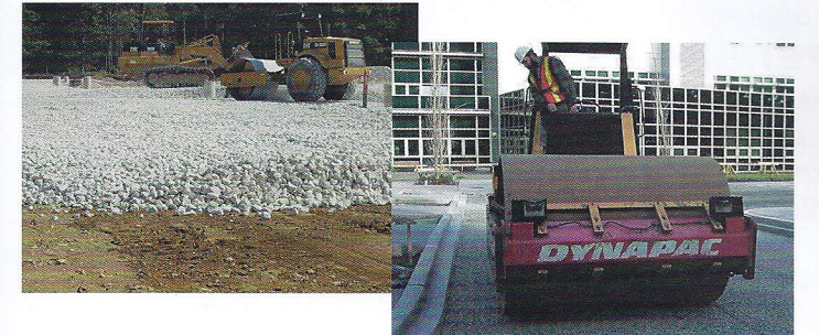
Base construction uses locally available materials.

Pavers are delivered ready to place, joints filled, compacted and ready for traffic.