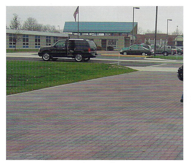
Driveway treats stormwater and reduces runoff at Brentwood School, Plainfield, IN.