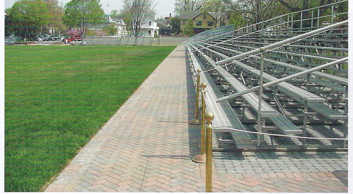
PICP under bleachers at the U.S. Naval Academy in Annapolis, MD provides struc tural support and on-site infiltration.

PICP makes a useful instructional tool for engineering, architecture, landscape architecture and construction students. The outdoor classroom provides a demonstration site to monitor performance and maintenance aspects and can have a lasting impact on students as they move into their careers.