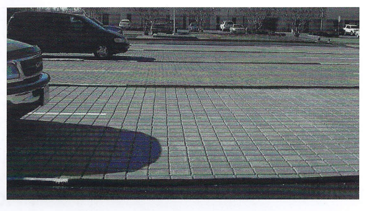
Multiple permeable pavement materials monitored by university students in Kinston, NC.

After placement, joints and/or openings filled with small aggregate and pavers are compacted.