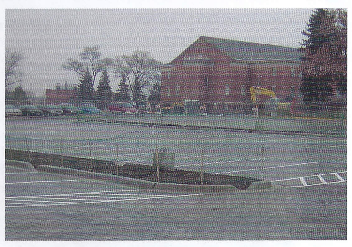
PICP functions as a retention pond and parking lot at the Elmhurst College, LEED<sup>®</sup> project in Elmhurst, IL, part of an LID sustainable site.

ICPI Civil Engineering University Curriculum Available (www.icpi.org/ university/)