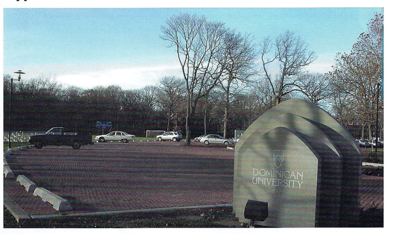
PICP lot eliminates need for detention basin at Dominican University, Chicago.