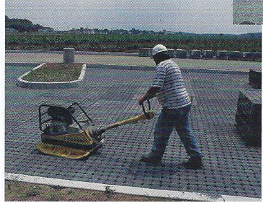
Mechanical installation equipment accelerates construction; typical 5,000 sf (500 m<sup>2</sup>)/ machine/day.

After placement, joints and/or openings filled with small aggregate and pavers are compacted.