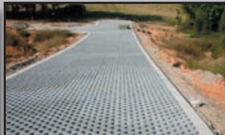
TURFSTONE 23-5/8" x 15-3/4" x 3-1/8"