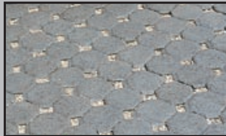
ECO-STONE 4-1/2" x 9" x 3-1/8"