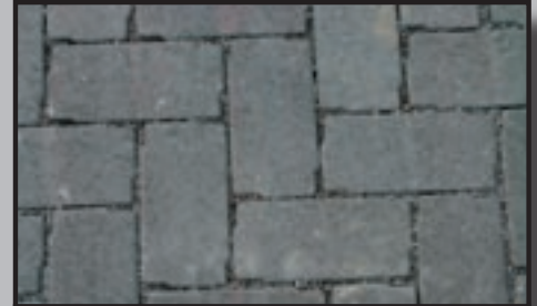
AQUA BRIC 5" x 10" x varies

These Permeable Interlocking Concrete Pavers (PICP) can be mechanically installed using specialized paver installation equipment which decreases your construction time. They can be installed in a variety of designs including running bond and herringbone patterns. Whether you are at your impervious coverage maximum limit or you are looking to obtain LEED credits, these pavers will meet your project needs.