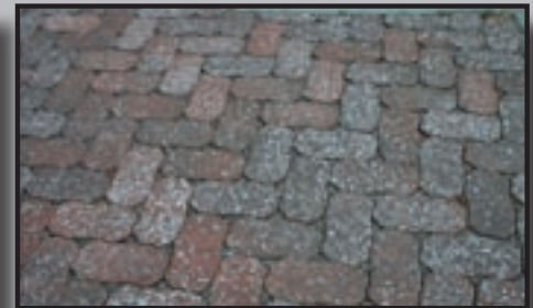
WATERSHED 5" x 9-5/8" x 3-1/8"