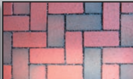
STORMPAVE (Clay) 4" x 8" x 2-3/4"