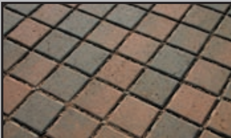
SF-RIMA 7-3/4" x 7-3/4" x 3-1/8"