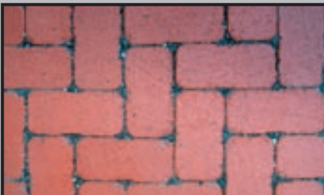
RAINPAVE (Clay) 4" x 8" x 2-3/4"