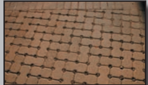
INFILTRASTONE 4-3/8" x 8-3/4" x 3-1/8"

Fred Adams Paving has a variety of fine products available that offer cost effective solutions to storm water run off, groundwater recharge and water pollution control while providing a naturally beautiful appearance to any application. The pavers listed below are manually installed and come in an assortment of colors and textures. Whether you are at your impervious coverage maximum limit or you are looking to obtain LEED credits, these pavers will meet your project needs.