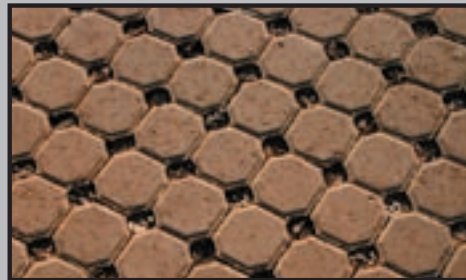
DRAINSTONE 4" x 8" x 3"